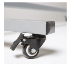
Sturdy locking wheels