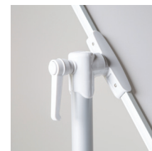
Positive tilt locking lever