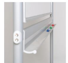
Full width pen tray